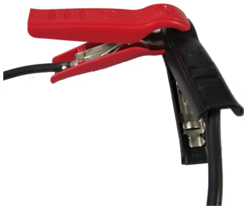
Figure 3: Charging clips in a short circuit

If the cable compensation needs to be repeated, the measurement can be carried out again in cable compensation mode by pressing the START button.