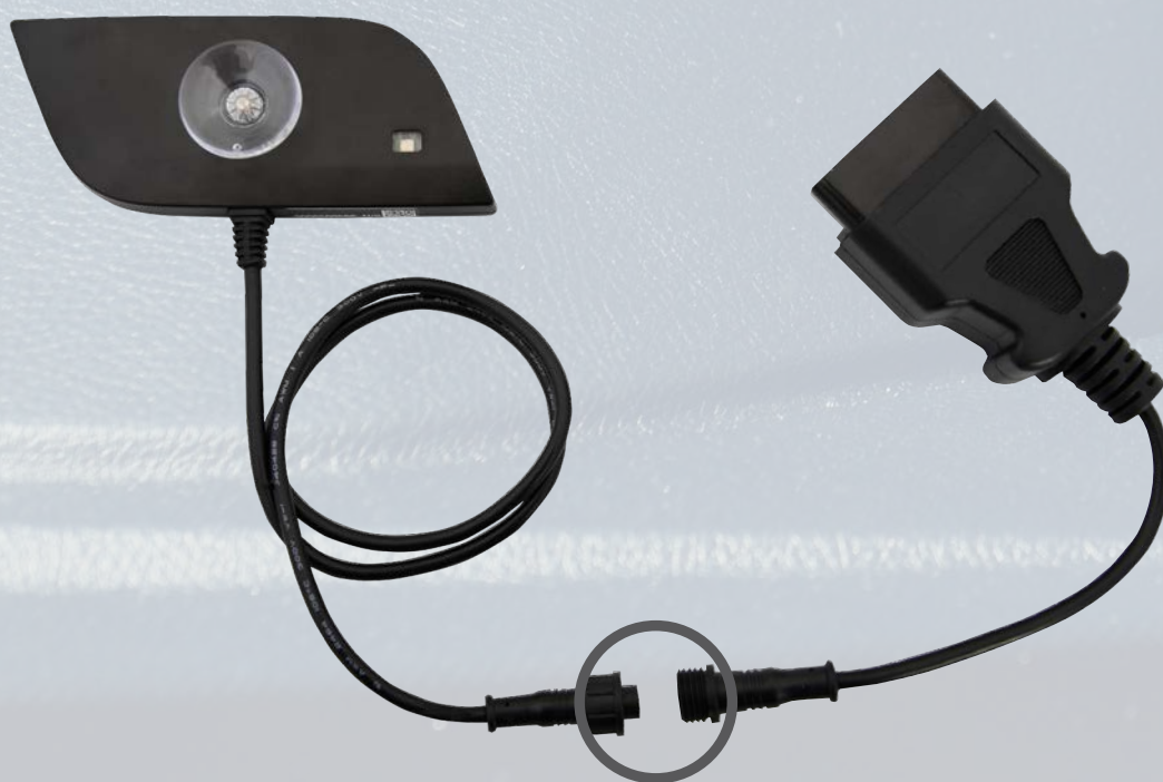
Connection with OBD-cable